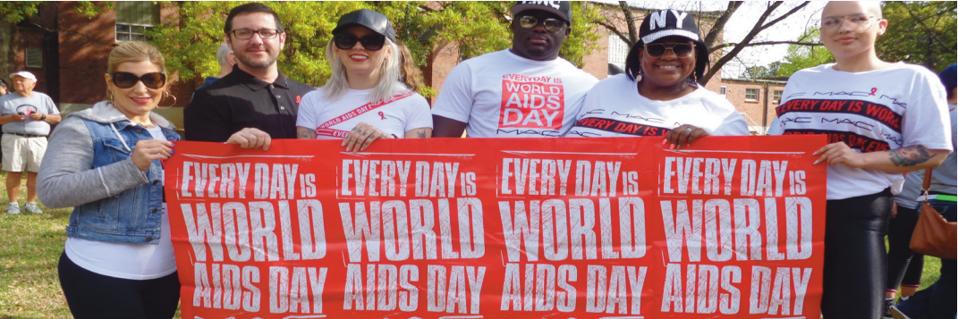
MAC Walk for AIDS Team